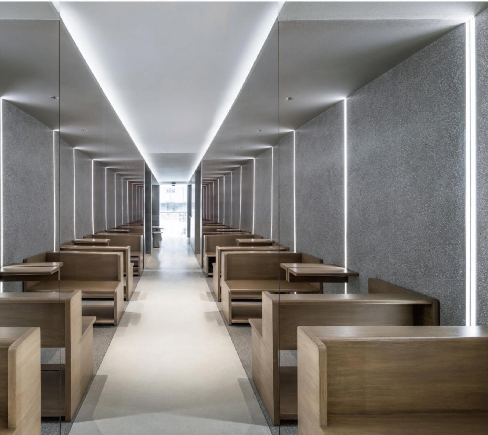
THE INTERSTICES / LUKSTUDIO INTRODUCES AN ARRAY OF LIGHT ON THE WALL TO ECHO THE OVERALL SPATIAL CONCEPT – THE INTERSTICES. WITH MIRROR LINING THE ENDS OF THE ROOM, THE RHYTHMIC ORDER APPEARS TO PROGRESS INTO INFINITY