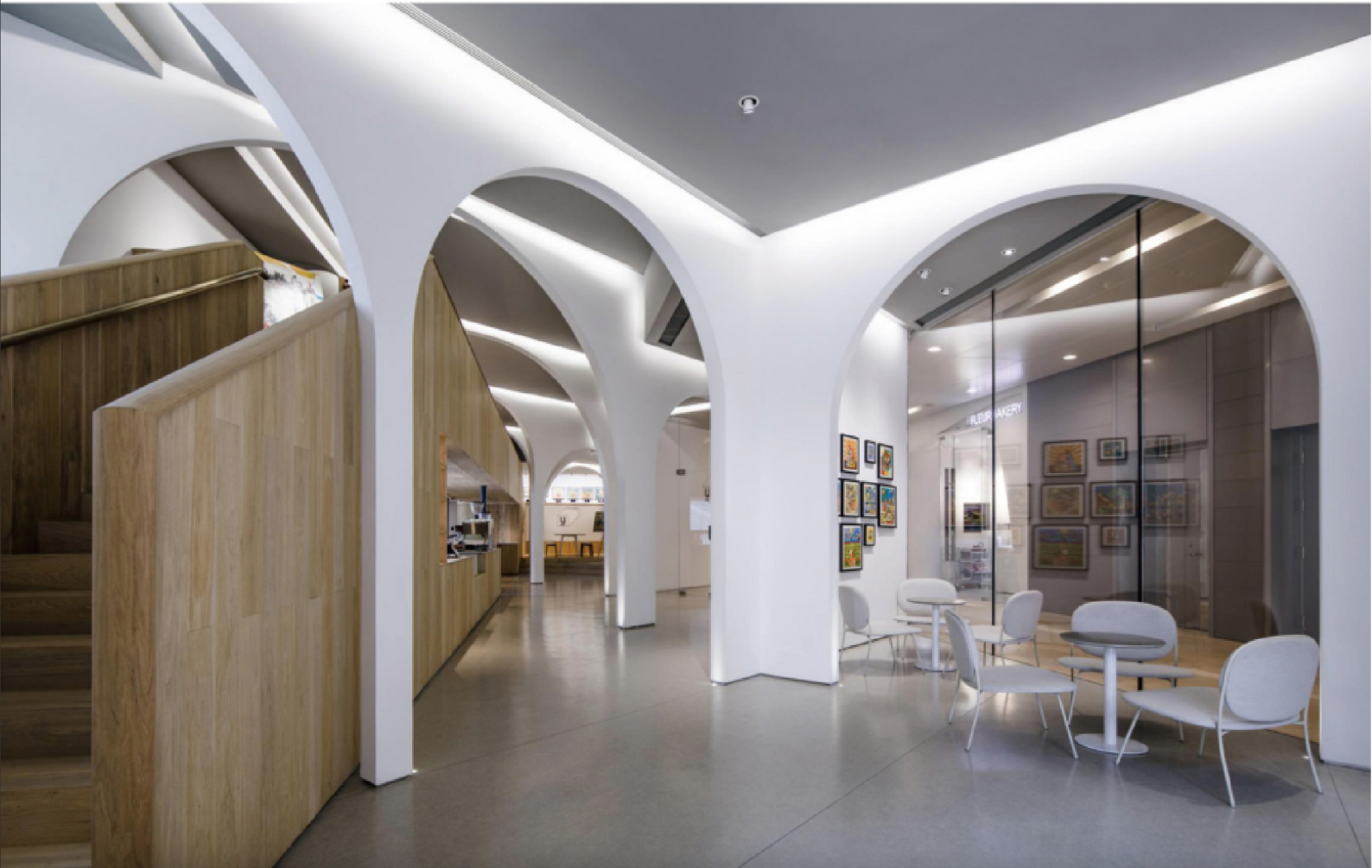
THE FOLDED ARCADE, DESIGNED BY LUK STUDIO