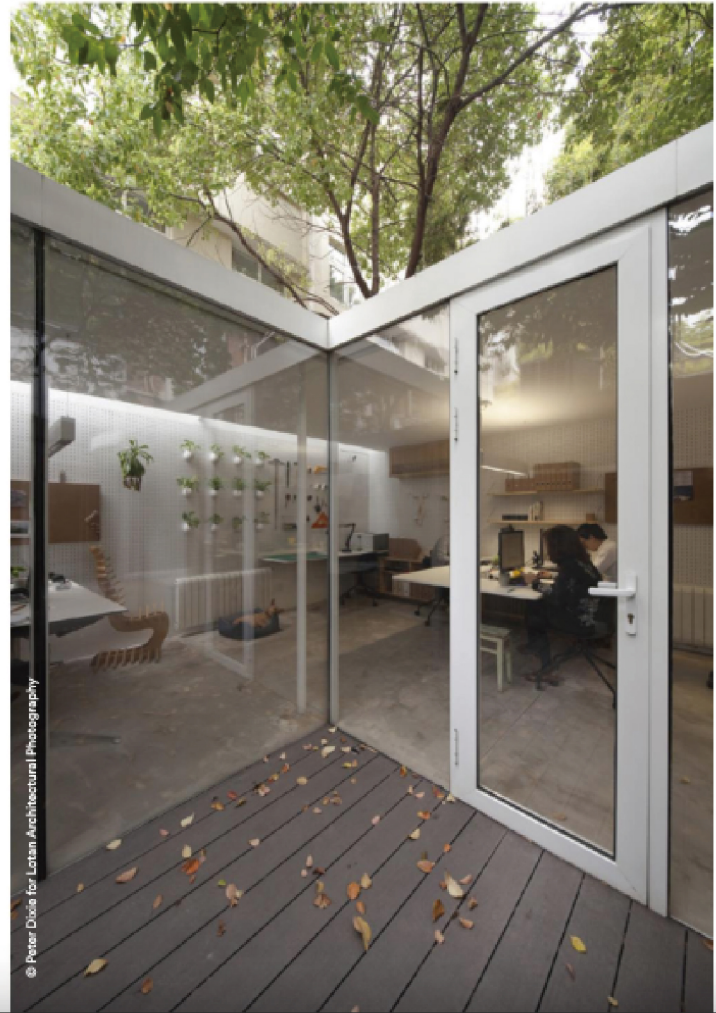
OFFICE AROUND A TREE