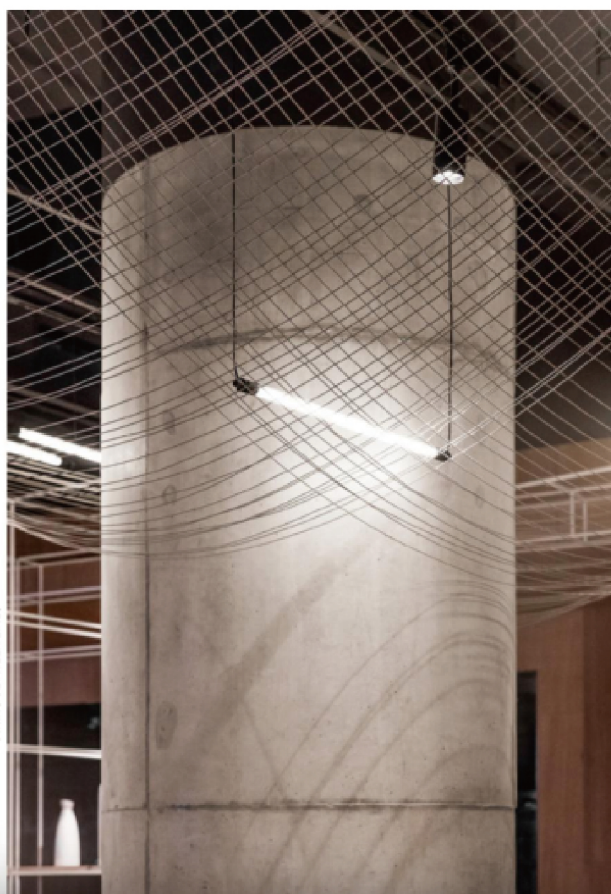
DINING BETWEEN LINES