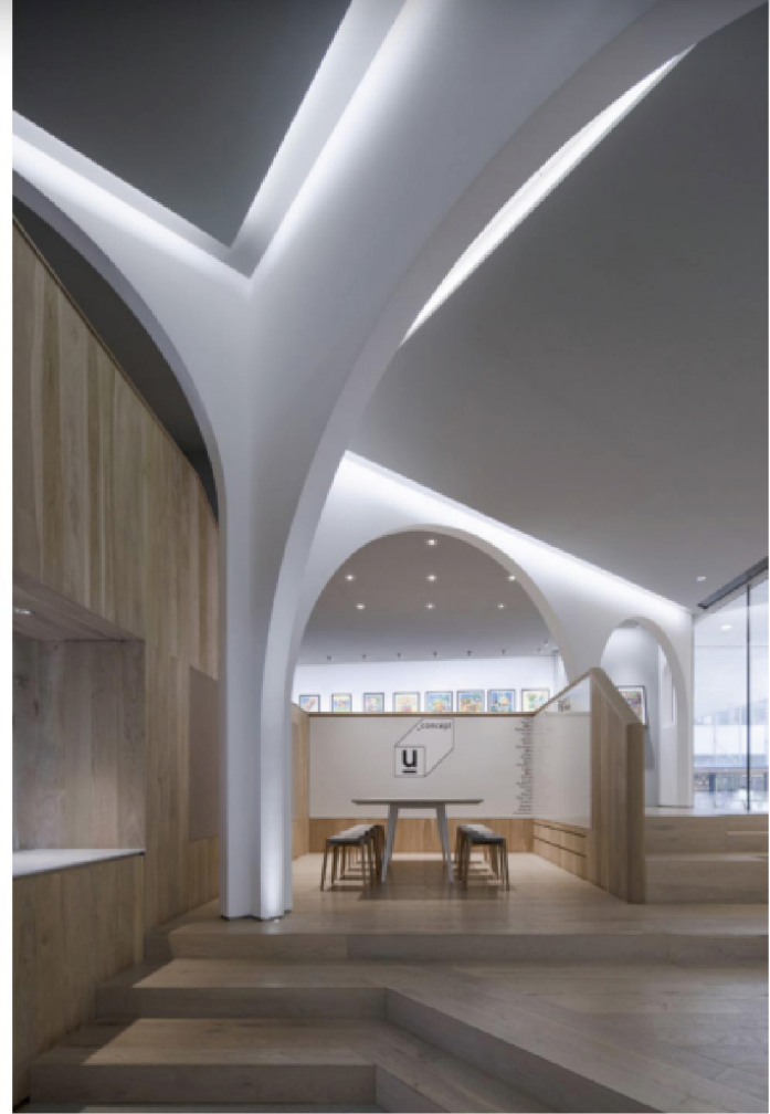
THE FOLDED ARCADE, DESIGNED BY LUK STUDIO

We caught up with her through the efficiency of Web tools as she sat on a balcony in Stockholm, overlooking a waterfront. Sun was up, spring nature was blooming all around, birds were chirping and she was, and I quote her, “as serene as I could ever be.”