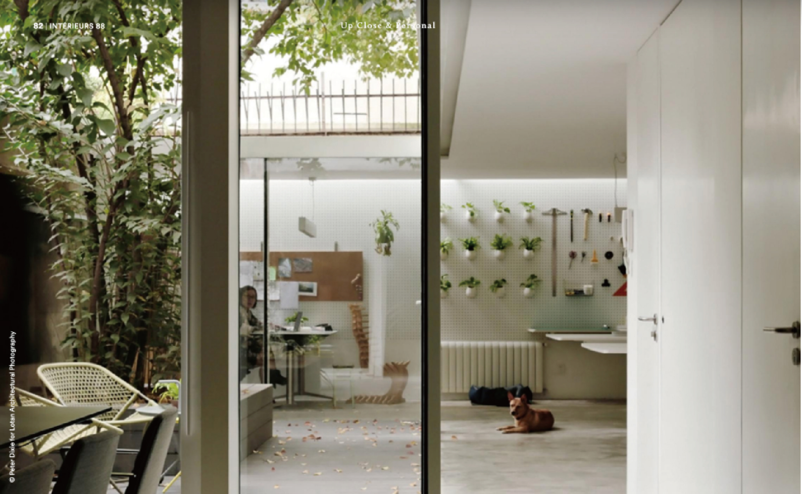
OFFICE AROUND A TREE / A FUSION OF NATURE AND WORKSPACE / THE L-SHAPED GLAZED ADDITION BEAUTIFULLY INCORPORATES THE MAJESTIC WINTERSWEET TREE AND THE INVITING OUTDOOR COURTYARD, SEAMLESSLY BLENDING NATURE INTO THE HEART OF THE WORKING LIVES.